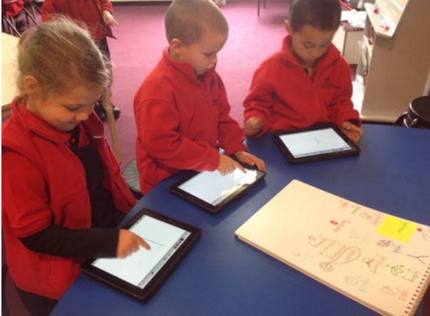
When combined with regular access to our mobile computer lab, our students have excellent access to learning technologies.